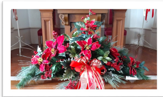
Image: Christmas decorations in the 1887 Church, 2019

This November join staff in decorating the buildings and grounds for the holiday season. More details coming soon!