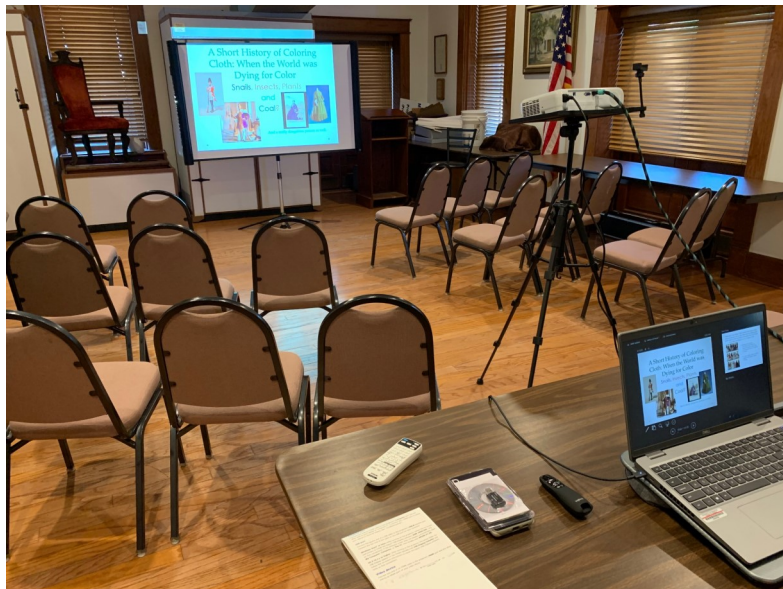
Manatee Village Historical Park Collection

Mourning during the Victorian era was a ritualized and necessary process to effectively grieve loved ones but, like many other aspects, the bloodshed caused by the American Civil War changed how mourning was carried out. From dog tags to embalming, many of the changes forced by the Civil War are still felt today and show how people adapt even in the most devastating circumstances to find a meaning in loss.