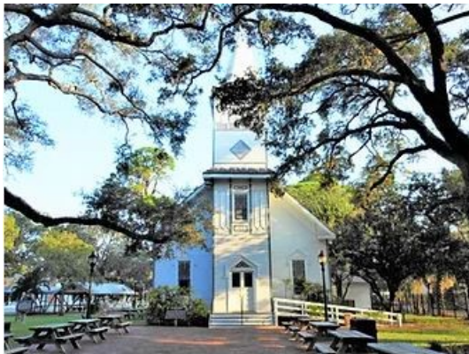
Manatee Village Historical Park Collection

Please see inside for the latest news and updates from Manatee Village Historical Park.