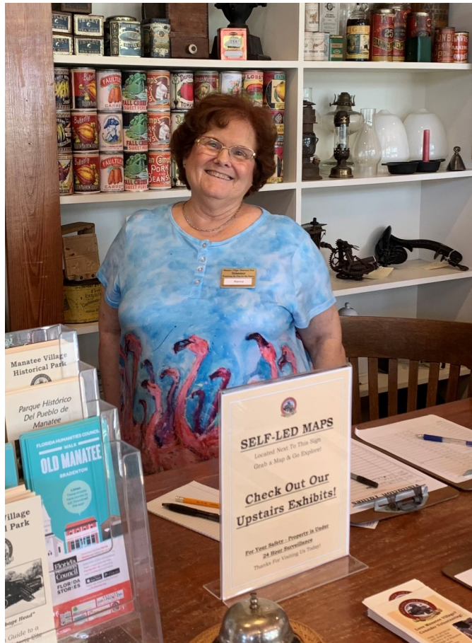
Manatee Village Historical Park Collection