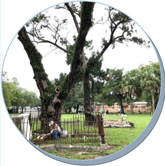
Image (above): Manatee Village Volunteers cleaning the 1850 Manatee Burying Ground in 2019

Manatee Village Historical Park will be hosting more cemetery cleanups on February 23rd, 24th, and 25th.