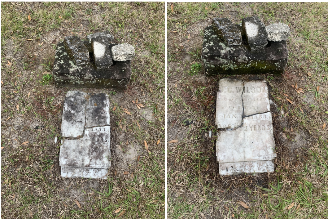
Images: Before and after cleaning a headstone in the 1850 Manatee Burying Ground, January 2021 cemetery cleanup.

Click here to be taken to Signup Genius .