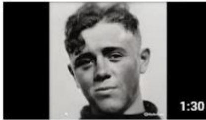
Early Settlers of Manatee County

Click on the image below or click here to watch!